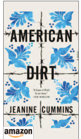
AMERICAN DIRT Jeanine Cummins