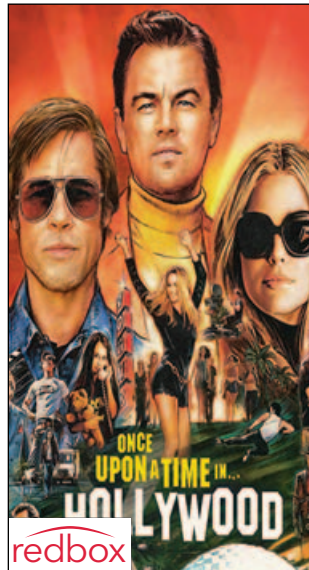
ONCE UPON A TIME IN HOLLYWOOD R, Comedy/Drama