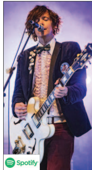
THE DEADBEAT OF HEARTBREAK CITY Beach Slang