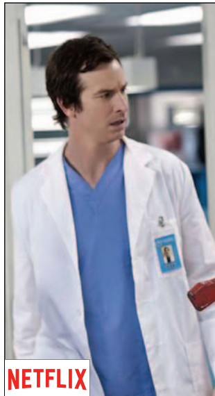
MEDICAL POLICE TV-14, Comedy