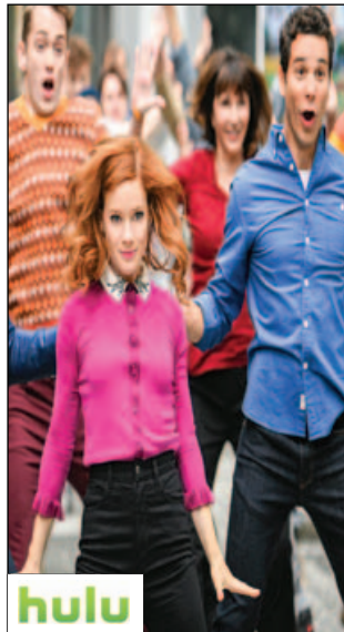
ZOEY'S EXTRAORDINARY PLAYLIST TV-PG, Musical/Comedy